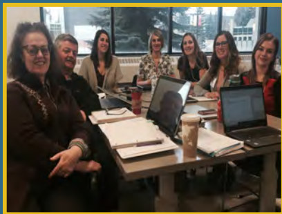
IBD Alberta team "We've Got Guts"