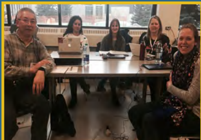
IBD National team "The MOB"

In November 2018, a nationwide call was sent out for digestive health patients interested in enrolling in the PaCER (Patient and Community Engagement Research) program. The year-long program is delivered through Continuing Education at the University of Calgary and delivered using a blended distance learning model. The program began this month and patients will be required to complete 3 courses where they will receive formal training in patient engagement research which includes theory and foundations, practicum in research and an internship in designing and conducting a research project.