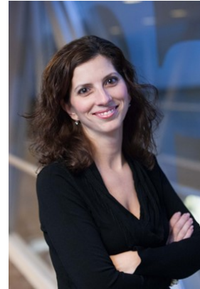
Executive Director, IMAGINE Network

Hope you enjoy our Network's new e-newsletter format!